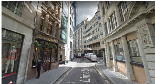
Street view of 34 Lime Street walking from Fenchurch Street

Address: 34 Lime Street, London, EC3M 7AT Telephone: 0203 544 4825