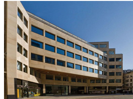
Front view of 34 Lime Street